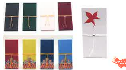
Concise blank book is unique

Write something here and take a photo to treasure up the wonderful memory in the Great Wall. "I was Here" Blank Notebooks with the theme of "four traditional Chinese symbols", "imperial robe" and "folk custom" represent the traditional Chinese culture and regional cultures, which are exquisite and eye-catching.